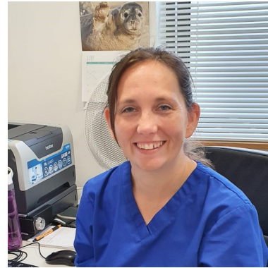
Health Care Assistants